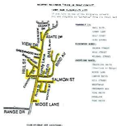
Residents in the area of Crestline Drive can sign up for the Candy Bank, a program to offset the costs of candy for trick or treaters