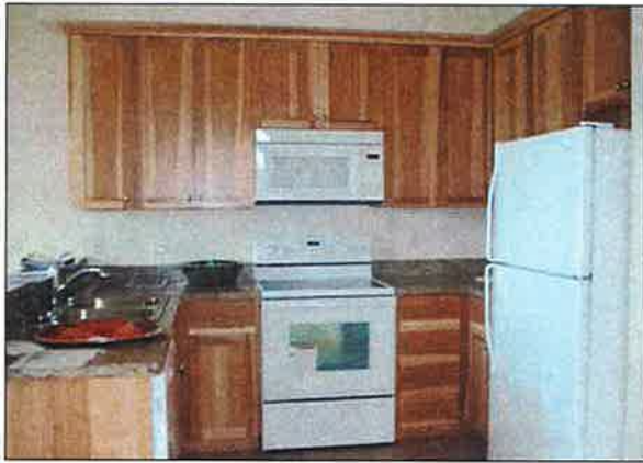
Right: On Oct. 20 and 21, interested residents had an opportunity to walk through one of the nearly-completed units, which included a full kitchen, handicap accessible bathroom and two bedrooms, one with a large closet.