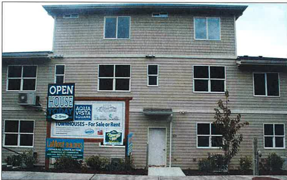
Top: Aqua Vista Square townhouses from Highway 101. These townhomes are being developed by Our Coastal Village for sale or rent to qualified individuals.